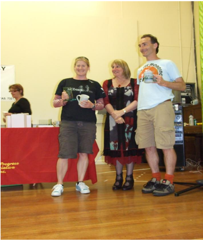
1 st Mixed Team: No Logo