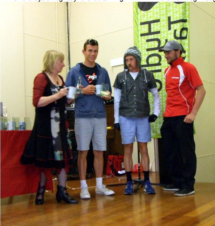
1 st Male Team :Ex Burnie High Boys