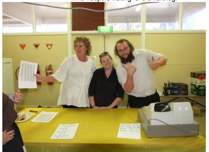
Our Bar Staff.