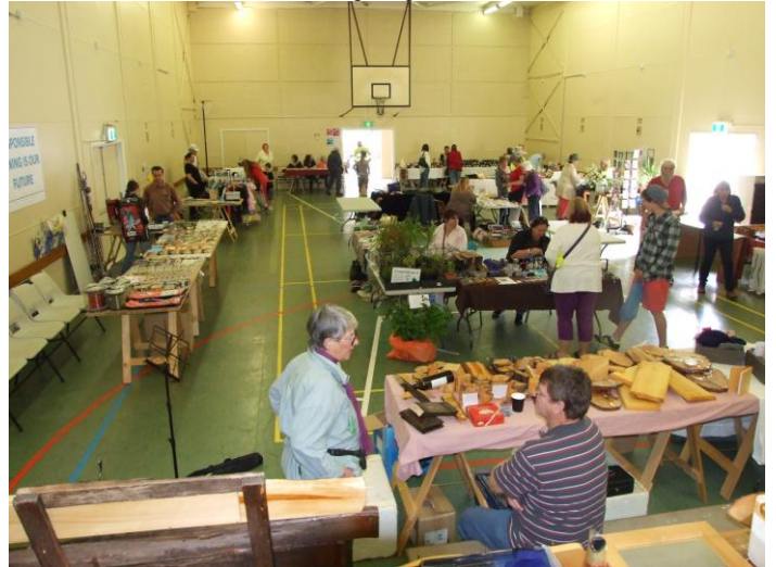
Stall Holders prepare for the Market.