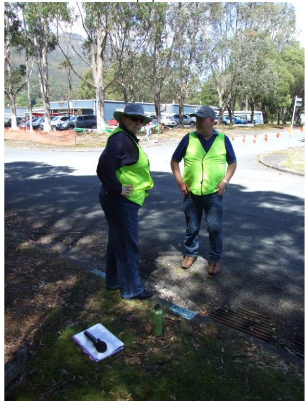
MC and Race Director discuss strategies.