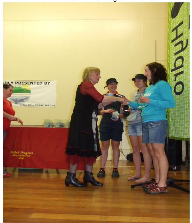
1 st Female Team :GG's