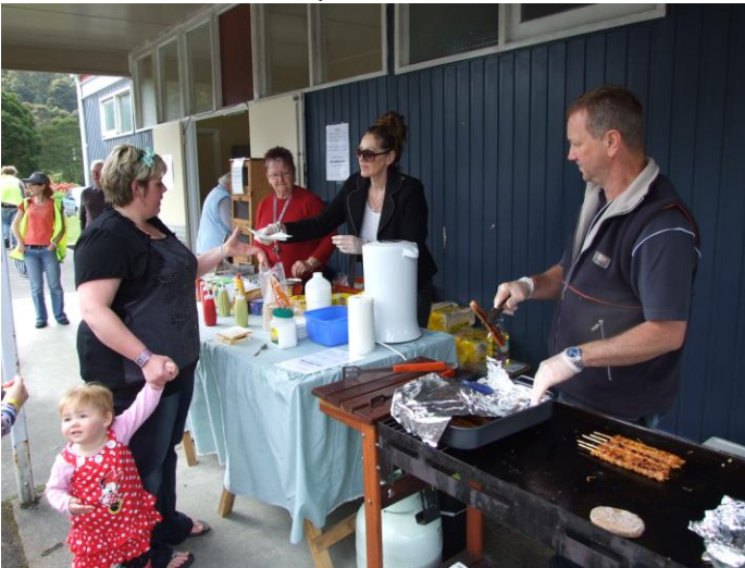
The Wee Georgie Wood Steam Railway BBQ