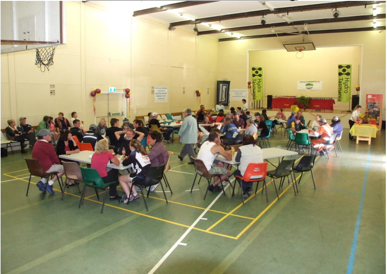
Competitors and Volunteers gather for the Presentation Evening at the Tullah Community Hall