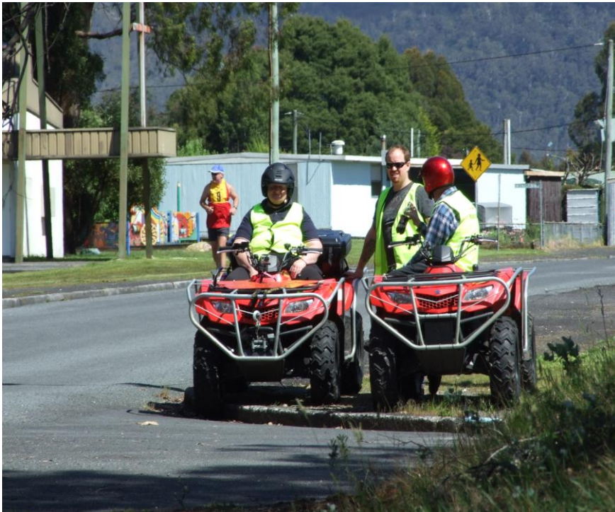
Run Leg Quad Bikes getting ready to roll.