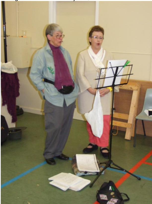
Buskers keep the crowd entertained!