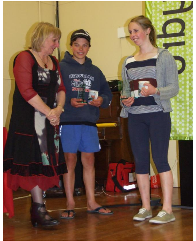
1 st Junior Mixed Team EJB