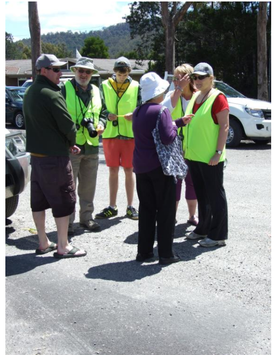
Time Keepers waiting for the next leg.