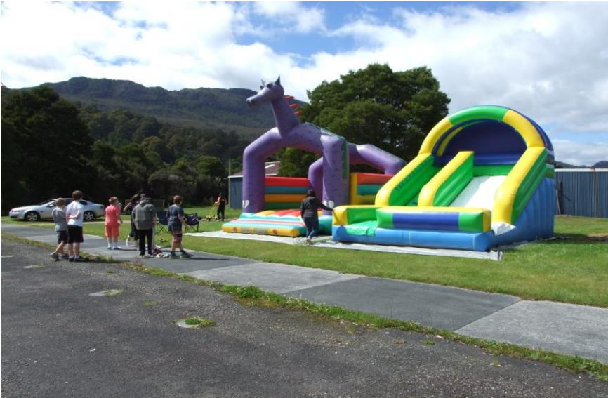
Children waiting patiently for the Jumping Castles to be ready for action!!!